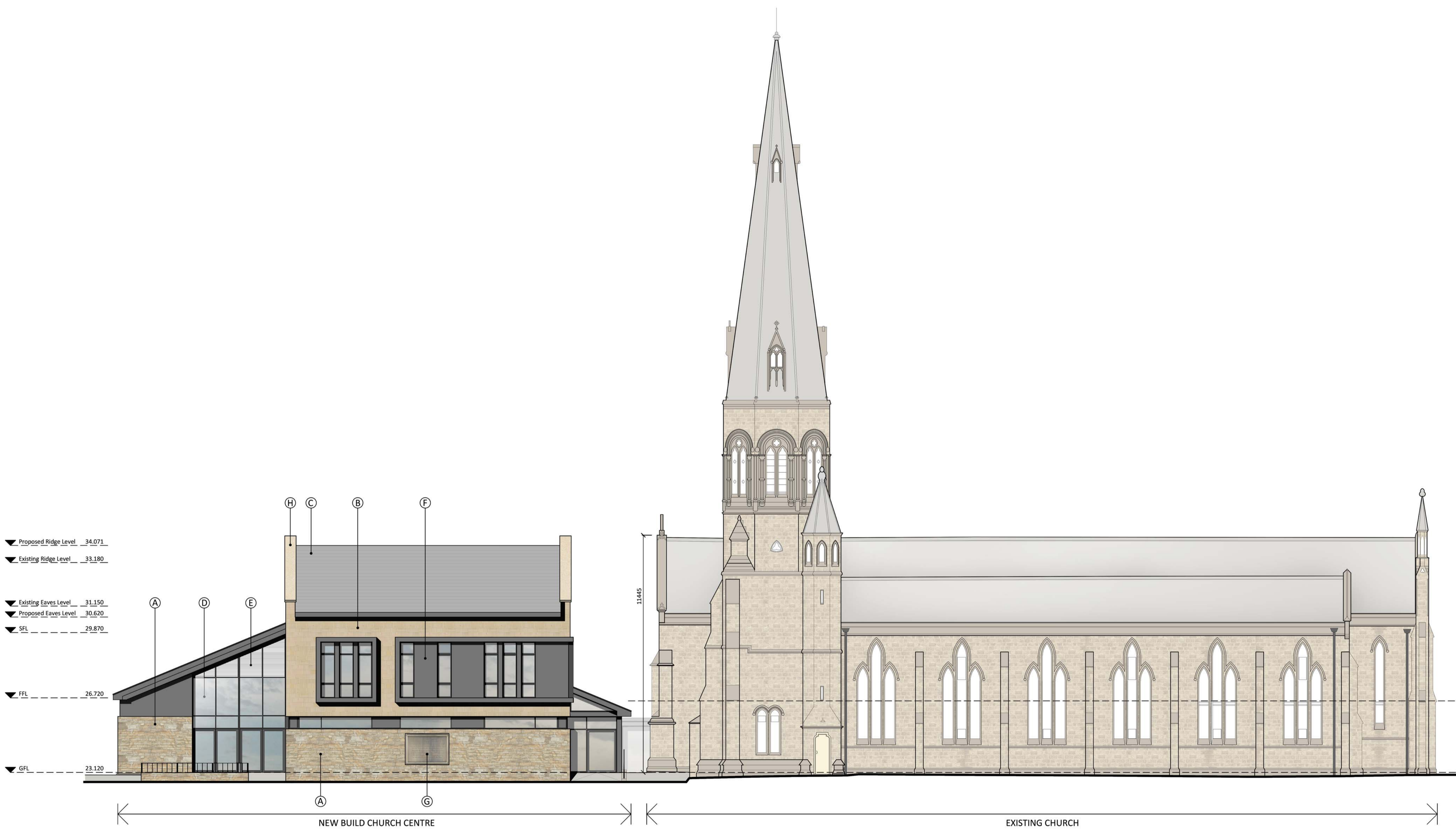
PROPOSED MARTON STREET ELEVATION